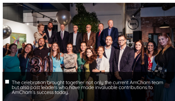
The celebration brought together not only the current AmCham team but also past leaders who have made invaluable contributions to AmCham's success today.