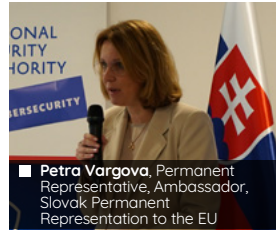
■ Petra Vargova , Permanent Representative, Ambassador, Slovak Permanent Representation to the EU

This conference highlighted the complexity of modern cybersecurity challenges and the need for continued collaboration between key stakeholders across sectors and borders.