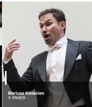
Mariusz Kwiecien