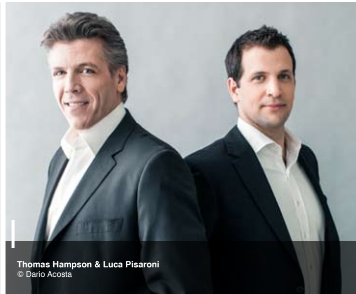
Thomas Hampson & Luca Pisaroni

As we see, the Kapos agency chooses the crème de la crème of