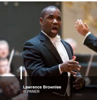
Lawrence Brownlee

The agency aims to attract culture oriented foreigners living in Slovakia to their concerts as well. The concerts of Joyce DiDonato and Thomas Hampson & Luca Pisaroni are must-sees for Americans. The period of the year for these events is also the time of meetings with partners, clients, and friends. A concert by a world-class opera singer is a good opportunity to give to such meetings higher value and create an unforgettable experience. In collaboration with the Sheraton Hotel Bratislava, we have prepared special offers for a pre-concert dinner or even accommodation for visitors not living in Bratislava. More and updated information is available on the webpage www.kapos.sk/en .