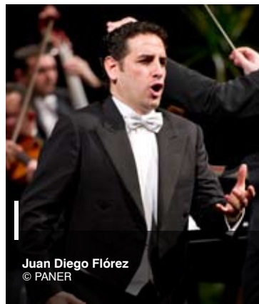
Juan Diego Flórez