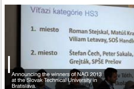
Announcing the winners of NAG 2013 at the Slovak Technical University in Bratislava.