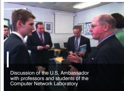
Discussion of the U.S. Ambassador with professors and students of the Computer Network Laboratory