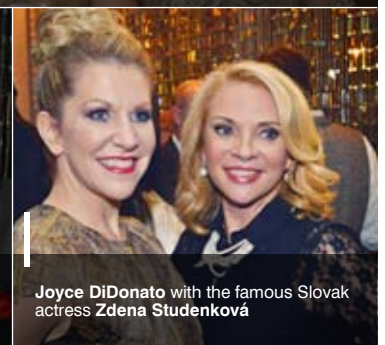
Joyce DiDonato with the famous Slovak actress Zdena Studenková