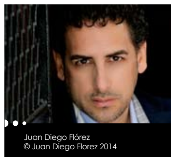
Juan Diego Flórez